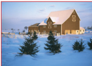
A Wisconsin Snowfall