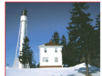
Sturgeon Bay Canal Station Light