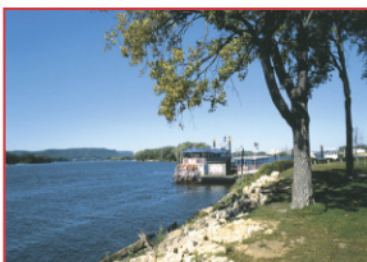
Along the Mississippi River