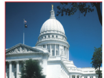
State Capitol in Madison