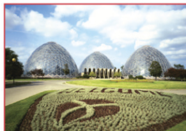
Horticultural Conservatory, Milwaukee