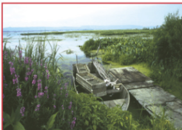
Near Brule Point