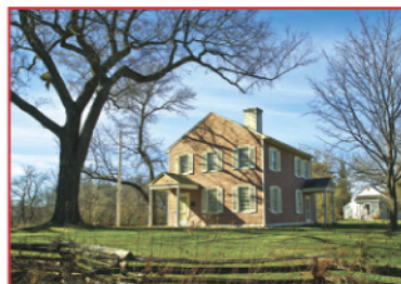
Historic Indian Agency House, Portage