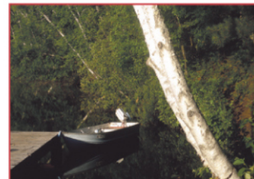
At Bass Lake