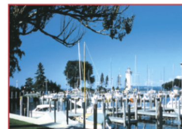
Lighthouse Harbor, Fond du Lac