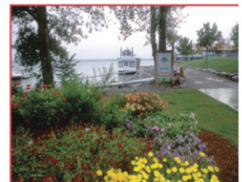
Lake Champlain at Burlington