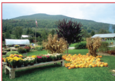
Harvest Time in the Green Mountains