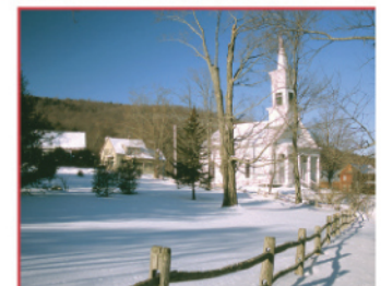
Winter in Barnard