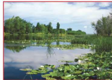
Grand Isle in Lake Champlain