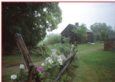
Ethan Allen Homestead Museum