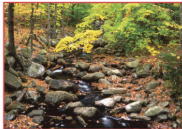
Green Mountain National Forest