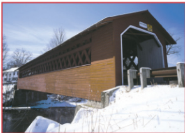
Henry Covered Bridge