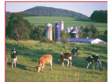
In Caledonia County