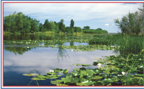
On the North End of Grand Isle in Lake Champlain in Vermont. Grand Isle State Park offers much of the beauty of Grand Isle. A variety of housing is available along Lake Champlain. Most homes are built on the island in the northern miles long and three miles wide. Just north is Hyde Log Cabin, considered by many to be the oldest log cabin in the nation. Having been built about 1788 by Abner D. Hyde, Jr.