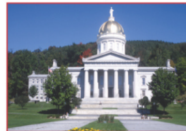
State Capitol at Montpelier