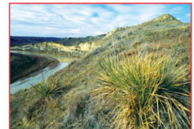
Little Missouri River