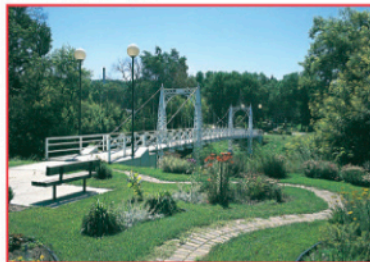
Valley City State University