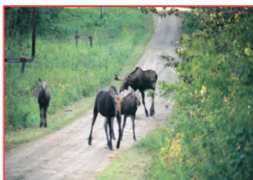
In the Turtle Mountains