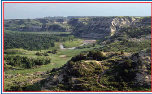
The Badlands and Little Missouri River near Medora, North Dakota. The Badlands of North Dakota are a unique part of the state's geographic mosaic and have played a significant role in the ongoing history of America. Badlands are formed by erosion of soft sedimentary rock. The High Badlands are one of the state's most famous attractions. The High Badlands cover a large portion of the state's western half. Theodore Roosevelt National Park is the largest and one of the best Badlands attractions.