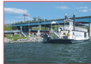
Port of Bismarck