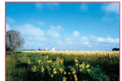
In Barnes County